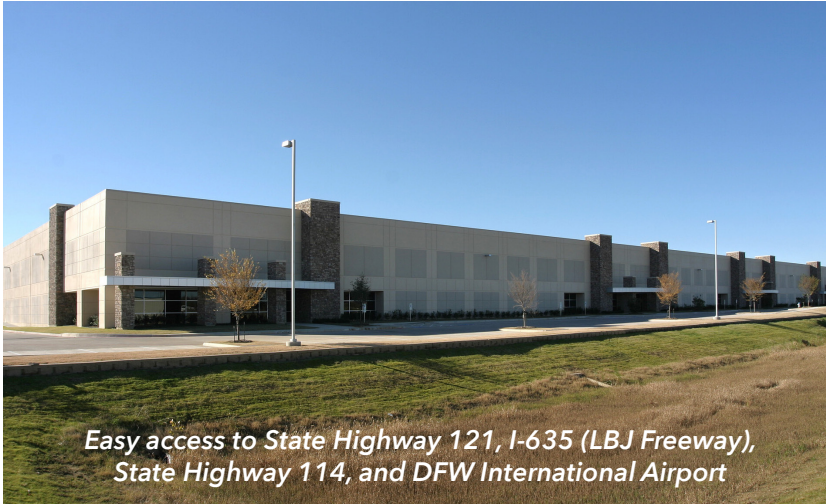
Easy access to State Highway 121, I-635 (LBJ Freeway), State Highway 114, and DFW International Airport

1420 Lakeside Parkway, Suite 105 Flower Mound, Texas 75028