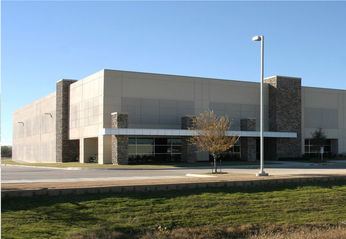
23,330 SF FOR SUBLEASE - FLOWER MOUND, TX